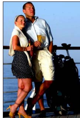
Expats usually earn a very attractive salary and lead a very good lifestyle

"You come out stronger and you emerge bolder... I believe what that does is make you feel a little bit invincible and prepared to take even more risks... you want to put all that into